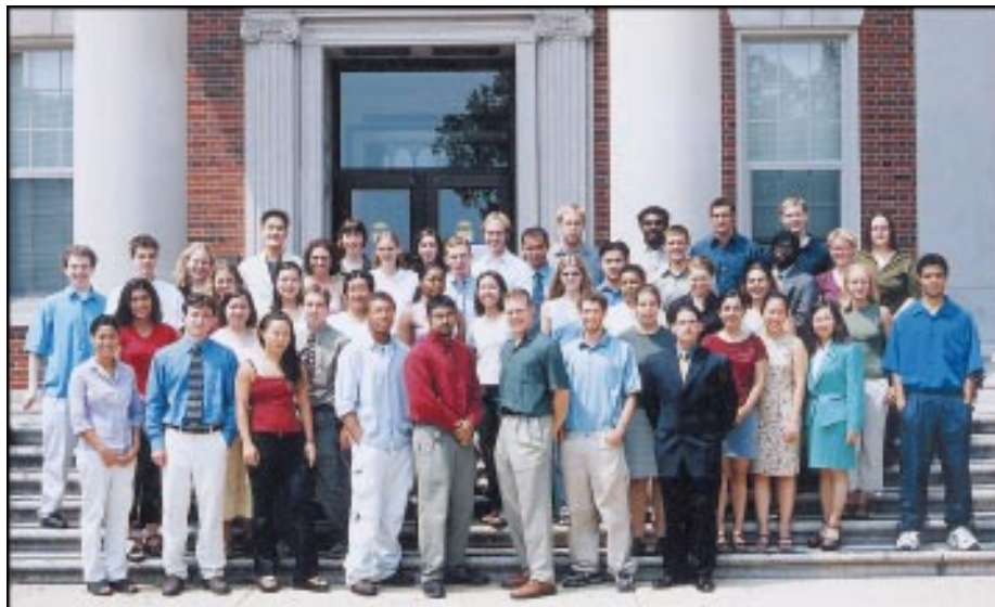
The 2001 NNUN REU Interns at the NNUN REU Convocation held at Howard University, Washington, DC.