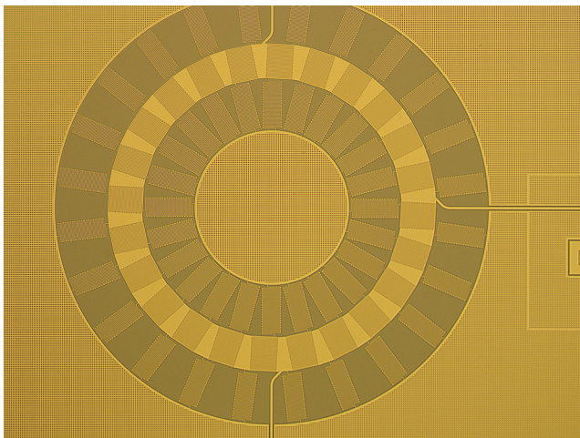
Figure 1: Optical micrograph of left-handed metamaterial ring resonator fabricated from Nb on Si.