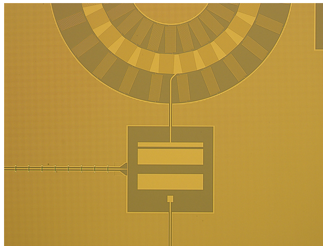
Figure 2: Zoomed-in optical micrograph of transmon qubit coupled to metamaterial ring resonator.