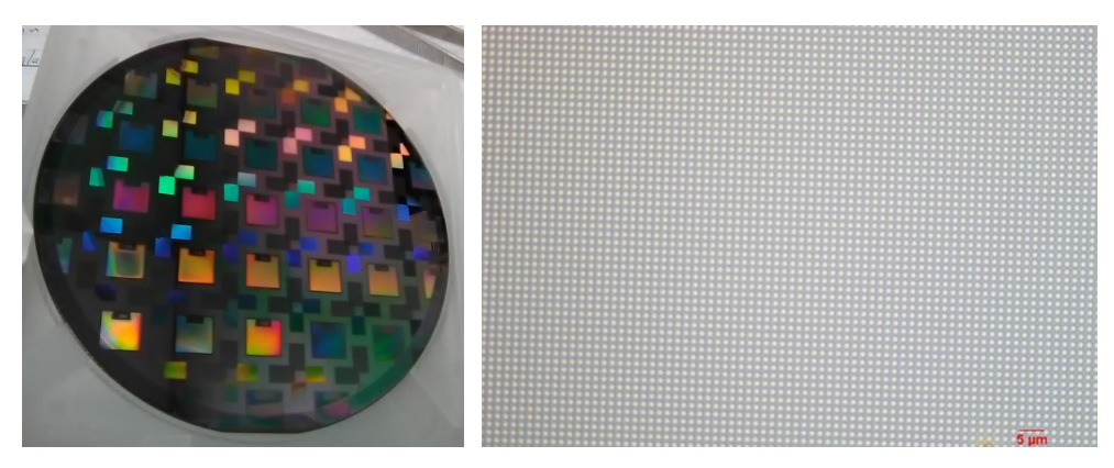
Figure 2, left: Wafer lithographically patterned with optical metastructures, using the ASML DUV stepper, Figure 3, right: Optical microscope image of test pattern of array of ~ 1 \mu m pillars, also patterned on the ASML.