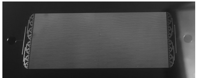
Figure 3: Etched silicon mold for hot pressing.