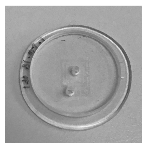
Figure 1: Image of completed microfluidic chip.

complete and ready to be turned into an immunoassay. An example can be seen in Figure 1.