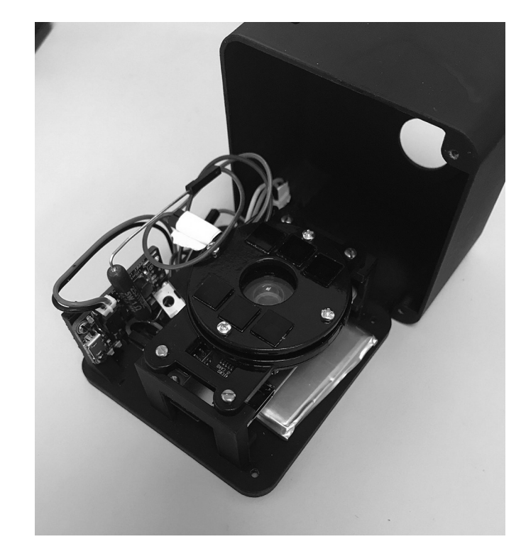
Figure 4: 3D-printed imaging device.